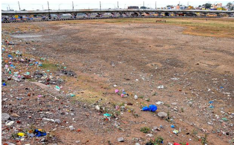
A view of dry Vaiga River in Madurai.