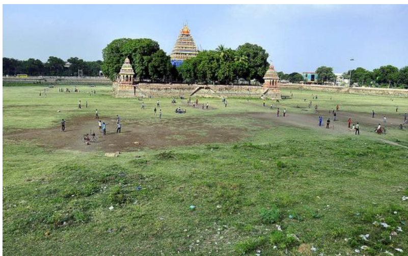
The Mariamman Teppakulam in Madurai.