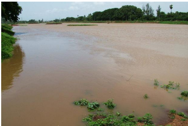
The Krishnampathy tank in Coimbatore.