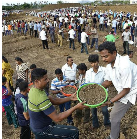
People help in desilting water bodies.