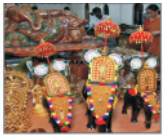
Craft, Community & Heritage