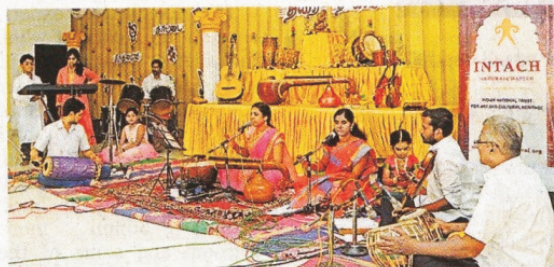
MELLIFLUOUS Exploring ragas and their use in film music

"Each raga has an emotion and we carefully picked six ragas that are widely used by