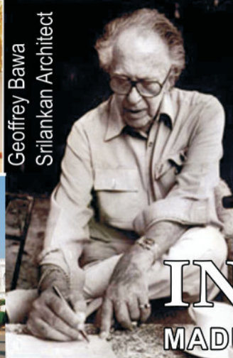
Geoffrey Bawa Sri Lanka Architect