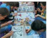
Heritage Education and Communication Service