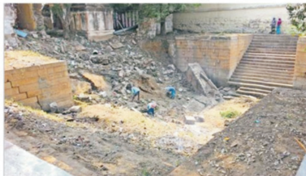
The 1000-year-old Thiruvapudaiyar temple tank at Sellur which lies in shambles is now being renovated by Madurai chapter of INTACH.

The flood had also affected the channel connecting the tank to the Vaigai river, he said. Since Wednesday, they have begun clearing up trees and shrubs in the tank. The team members