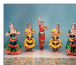
Intangible Cultural Heritage