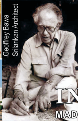
Geoffrey Bawa Srilankan Architect