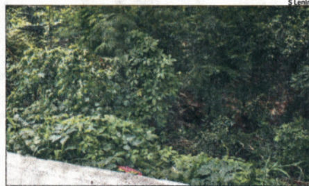
AMIDST THE OVERGROWTH: The tank is now in a dilapidated condition and overgrown with shrubs and trees